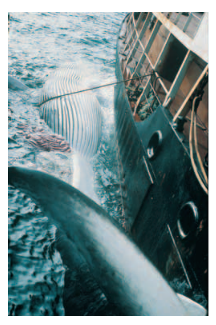
Currently the IWC considers the cruelty of whaling just in terms of Time to Death. The IWC should also turn attention to injuries caused to whales during whaling and how this may affect the degree of suffering.