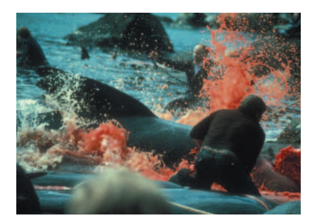
Pilot whale hunting in the Faroe Islands. Whaler in the background is holding the old sharp ended gaff or hook used for securing the whales.

There is much debate within the IWC as to whether the Commission has competence for dealing with matters relating to small cetaceans (dolphins, porpoises and small whales). Nevertheless, the Scientific Committee has established a Sub-committee on Small Cetaceans, which considers conservation issues and offers management advice, and the Workshop on Whale Killing Methods has specifically addressed small cetacean struck and lost rates in its Action Plan<sup>34</sup>. This section is far from comprehensive, but provides some examples of current small cetacean hunts around the world.