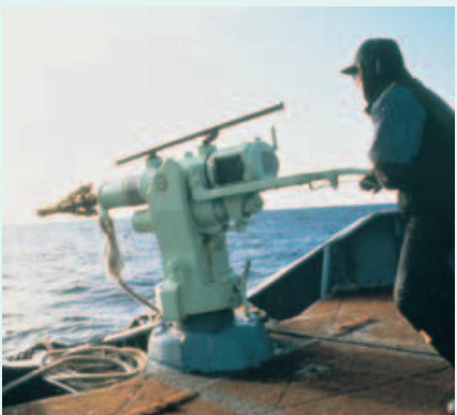
Weather may play a very significant role in the accuracy of whaling and therefore will influence the number of instantaneous kills and the struck and lost rate.

Japan admitted to the IWC Workshop in 1999 that the differences between the proportion of immediate kills for Japanese and Norwegian hunts could, in part, be attributed to the different sea and weather conditions.