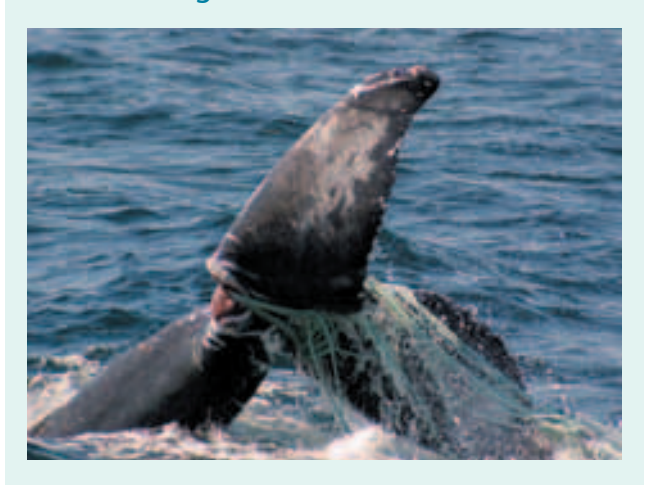
Tail of a humpback whale showing damage caused by fishing gear.

The IWC recognises with concern the problem of the incidental capture (by-catch) of whales in fishing gear, but has not closely examined the way these animals are killed or their subsequent use. For example, it is known that in Greenland, by-caught or otherwise wounded baleen whales may be euthanased and their meat distributed for human consumption. Although around three humpback, fin or minke whales are killed this way each year, the Commission has never factored this source of meat into Greenland's ASW quota nor has it considered the method used to kill the whales20. However, the scale of this issue, and the potential for abuse, has been brought into sharp focus by recent developments in Japan.